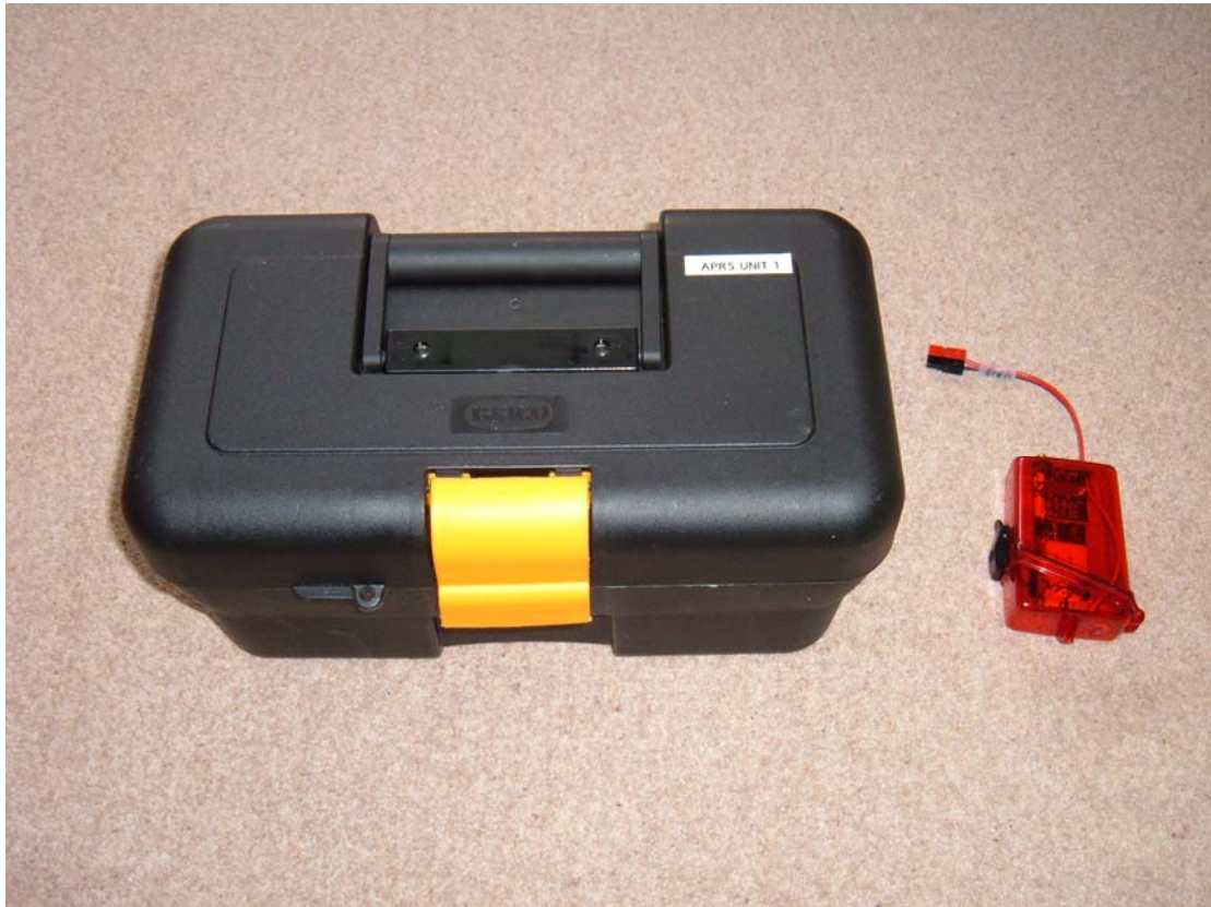
Figure 1 - Two Trackers

Figure 1 shows two examples of trackers. A toolbox tracker is on the left, a Beeline BLGPS is on the right.